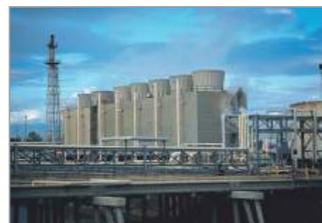
Oxidizing microbiocide for cooling water systems