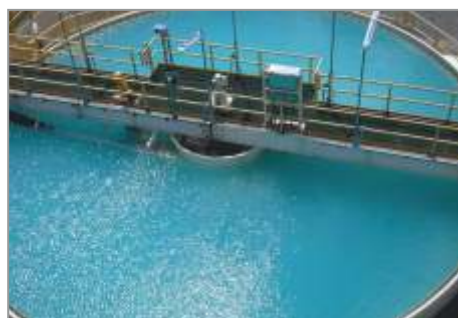
Disinfection of civil sanitation and waste water