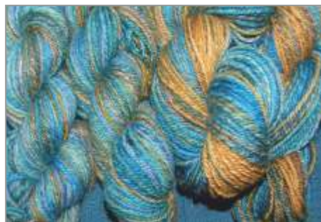
Anti-shrink agent for woollens and battery materials