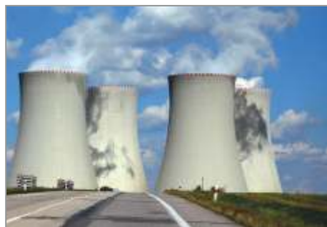
Power Plant – Cooling Towers