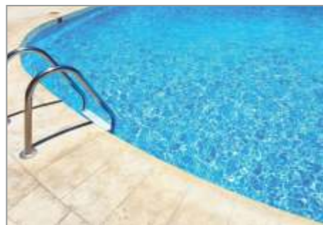
Disinfection of swimming pools