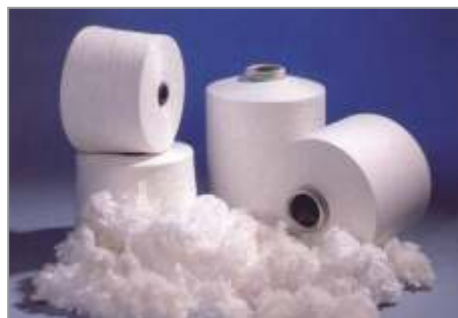
Bleaching agent for cotton, gunning, and chemical fabrics.