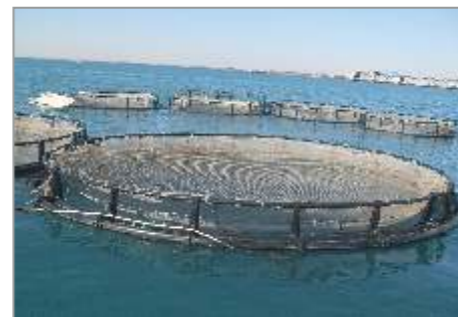
Preservative in horticulture and aqua culture industries