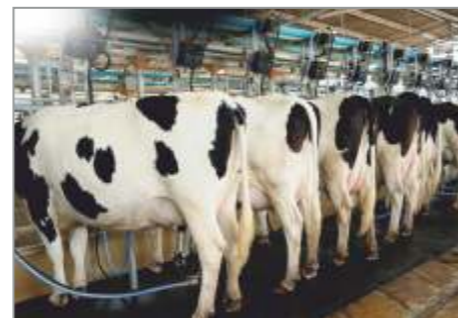
For animal husbandry and plant protection