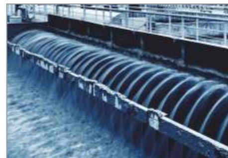
Disinfection of industrial water pretreatment